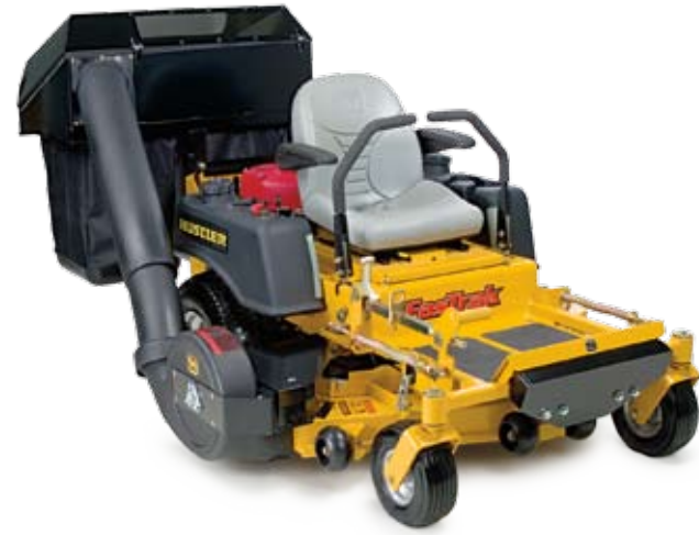
Optional catchers help the FasTrak maintain a professional-quality lawn.

the other way with true zero-turning-radius maneuverability. Unfortunately, the FasTrak is so quick and productive that you will finish in as little as half the time of a comparable lawn tractor. So, your fun on the mower will be over before you know it. You'll spend time waiting for the grass to grow so you can do it again!